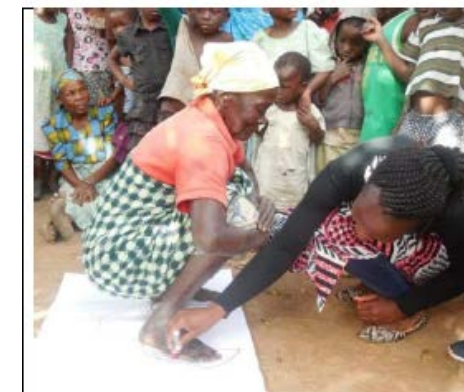
Figure 14. Older woman participating in squatting activity