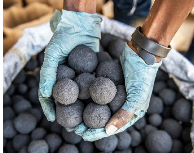
Waste-to-resource / Businesses that use waste to create added value products relevant to the markets in which they operate.