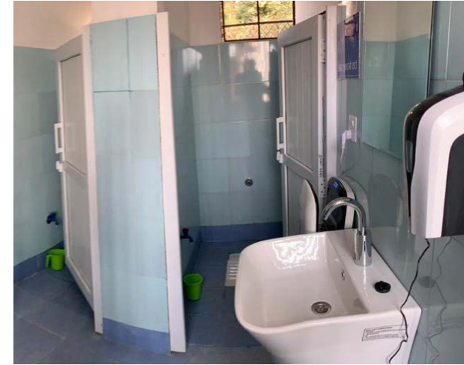
Bundled services / Offering safe, clean sanitation and hygiene facilities in community settings