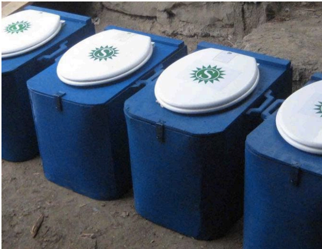
Container-based sanitation / Stand-alone toilets with sealable, removable containers for homes or residential compounds.

We invest in and enable the most promising sanitation and hygiene solutions to reach scale in low-income urban and peri-urban communities with a focus on: