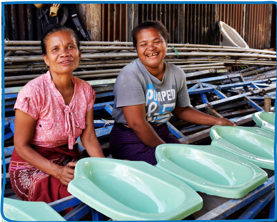
WASH entrepreneurs from Malaka District

Improving accessible and sustainable sanitation products, facilities and services