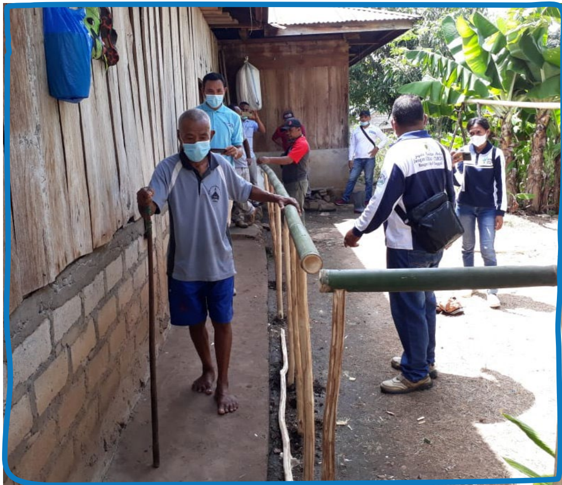
Elderly man in Manggarai District accessing inclusive toilet in his house

Increasing sanitation demand and community behavioral change